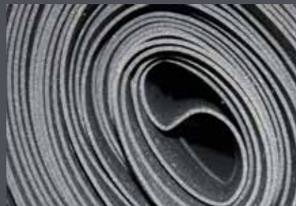
EPE production waste