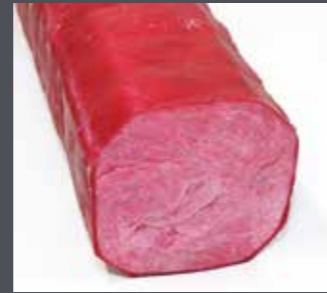
Block of EPE, not cross-linked