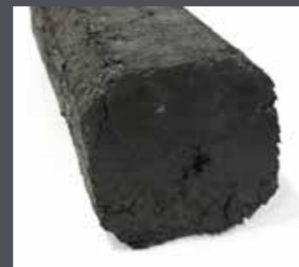
Block of EPP