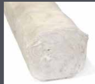
Block of EPE, not cross-linked