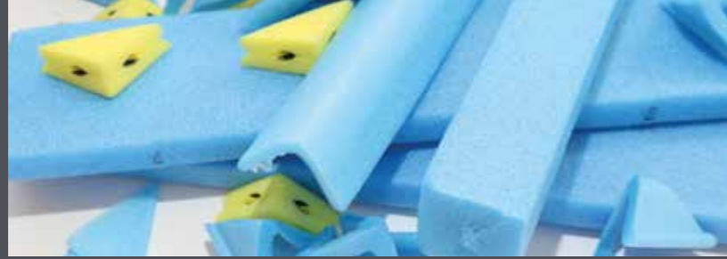
EPE production waste, flexible foam

EPP molded parts and packaging | EPP load carriers | EPE foam cross-linked | EPE foam not cross-linked