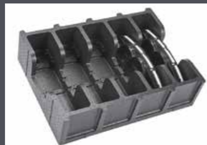
EPP load carriers