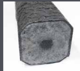
Block of EPE, cross-linked