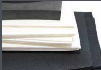
EPE production waste