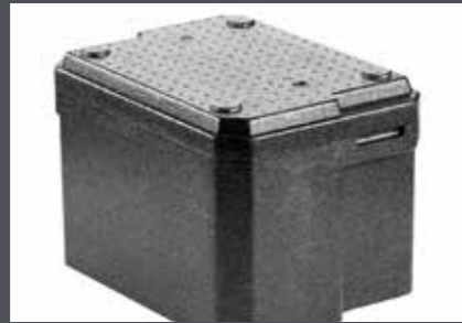
EPP insulation box